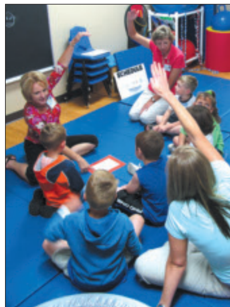
Staff work with children at Camp Mercy, a summer program for children with autism. Camp Mercy, now in its sixth year, is being held in the new Mercy Service Club Autism Center.

Families across our community who have children on the autism spectrum can breathe a collective sigh of relief—they now have the additional support they need, locally.